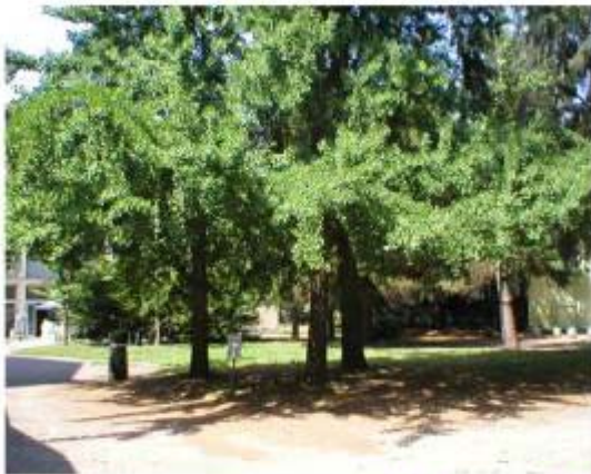
the square with planted trees