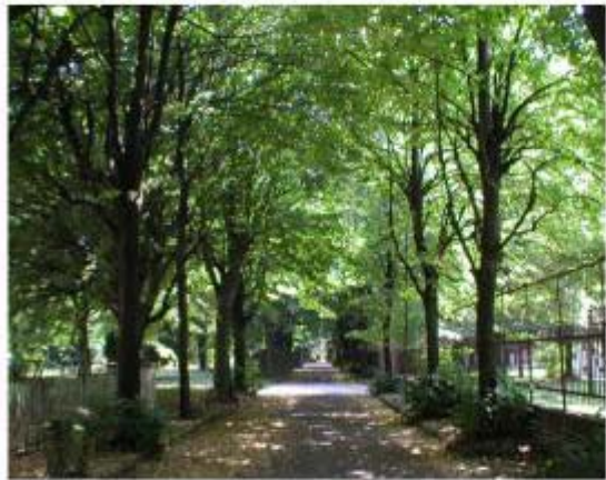
the avenue of trees