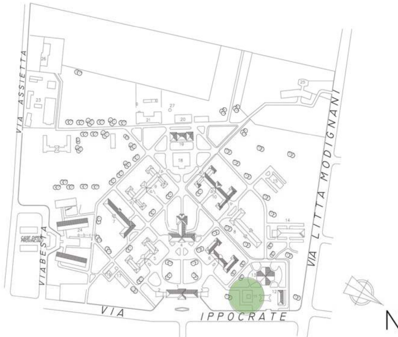
Ex mental hospital Paolo Pini. The plan